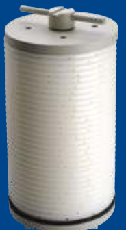
Disc filter assembly