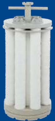
Cartridge filter assembly