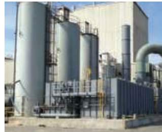
Foundry & Automotive