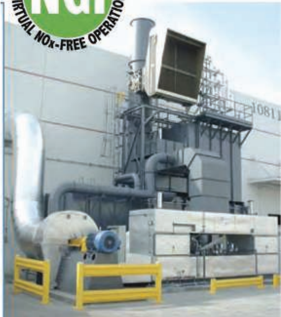
Web Offset Printing with Chiller