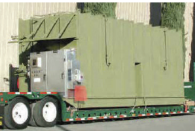
Wood Cabinet Spray Coating

CECO Adwest was founded to provide industry with affordable, energy efficient and reliable regenerative thermal oxidizers for control of Volatile Organic Compounds (VOCs). Every RETOX dual chamber RTO Oxidizer includes our low pressure drop 95-97% thermal efficiency engineered ceramic media with flameless NGI and NO x free operation. Additional major CECO Adwest advantages to consider in your RTO evaluation include: