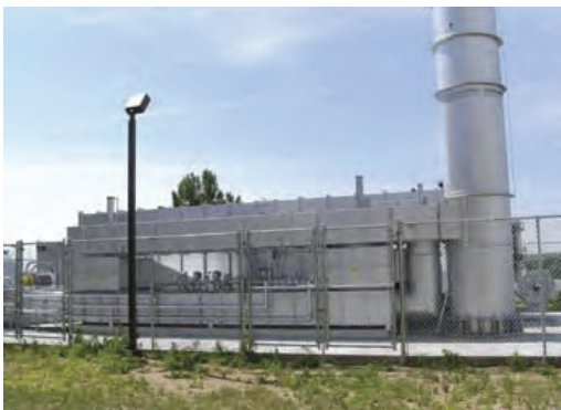
Printing & Coating