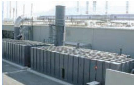
RV Paint Finishing

Contact us today for a custom RETOX RTO proposal