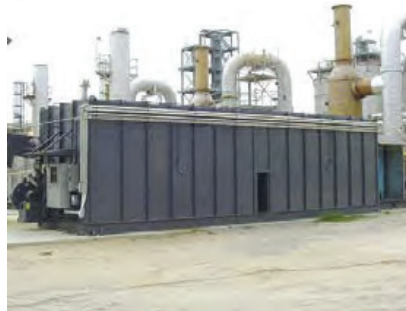
Chemicals & Halogens