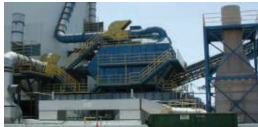
Mega Shredder Recycling with Acid Gas Scrubber