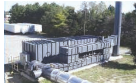
Automotive Parts Finishing