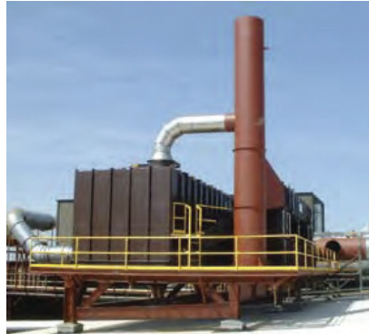
Packaging Flexo Printing