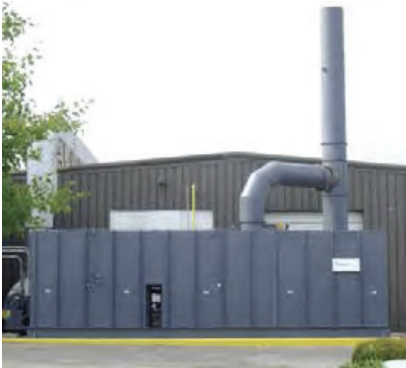
Web Offset Printing