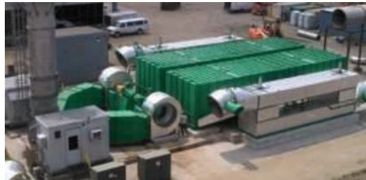
Ethanol & Biofumes Processing